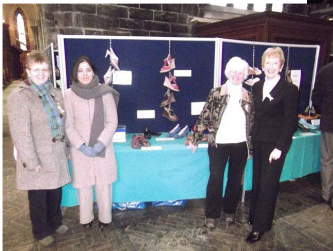
Shoes in interfaith exhibition and members of the interfaith group on domestic abuse